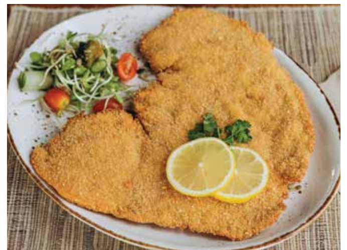
Woo's Cordon Bleu