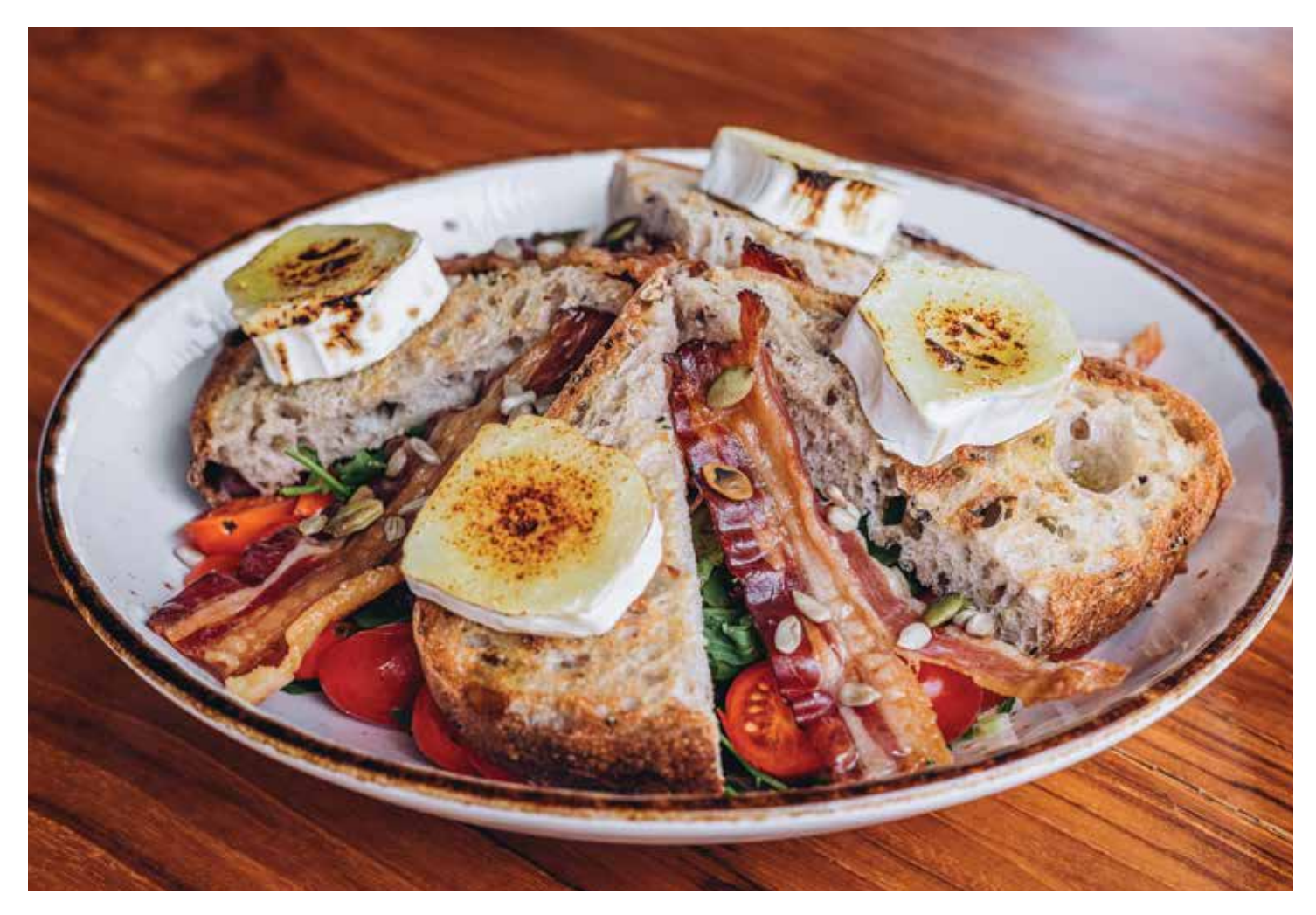
Goat Cheese Salad

All prices are in Thai Baht and excluded VAT 7%