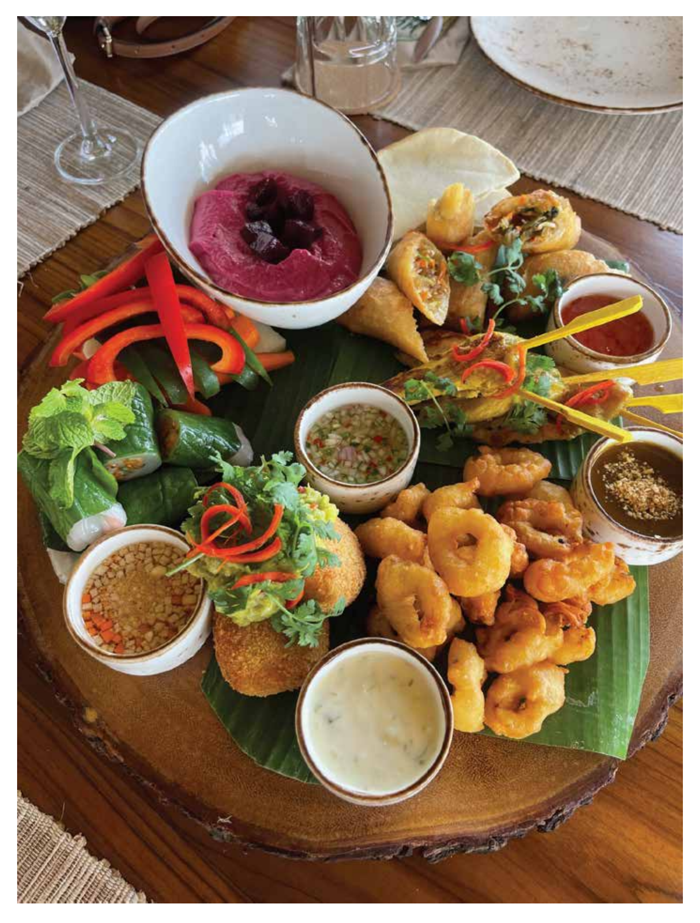
6 Tapas Board