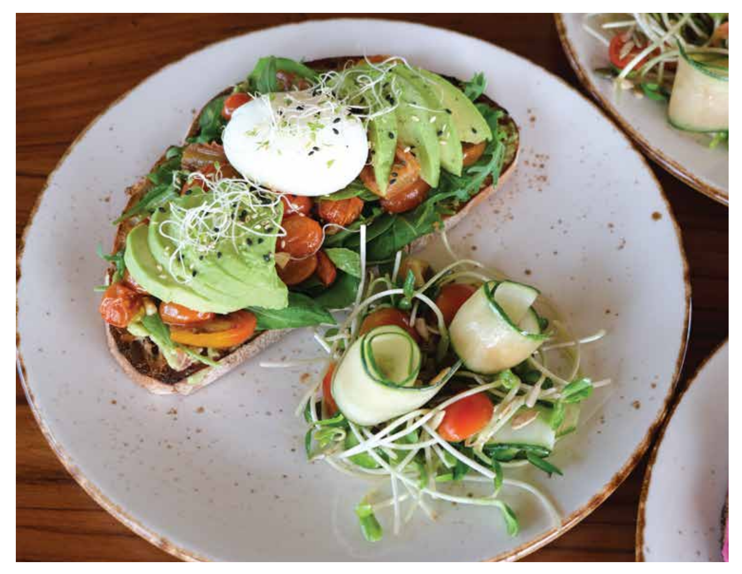
Tartine La Mollette