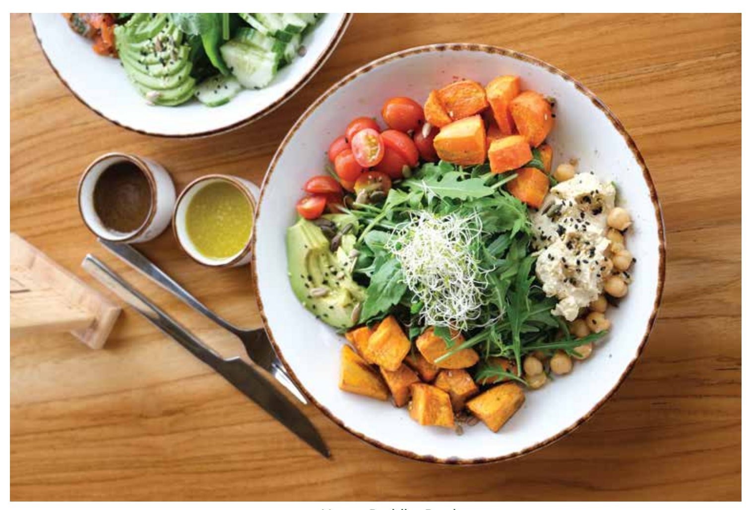
Vegan Buddha Bowl