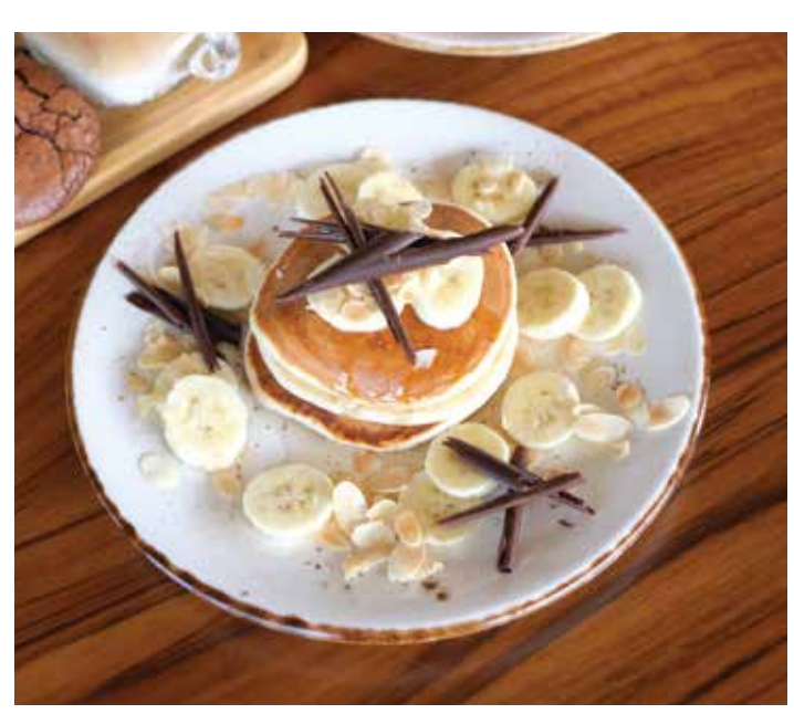
Homemade Banana Pancakes