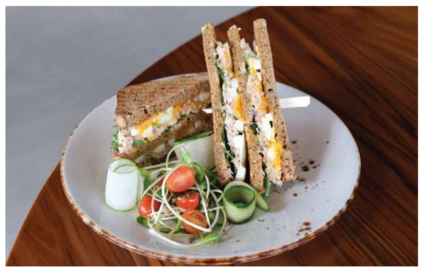
Tuna Club Sandwich