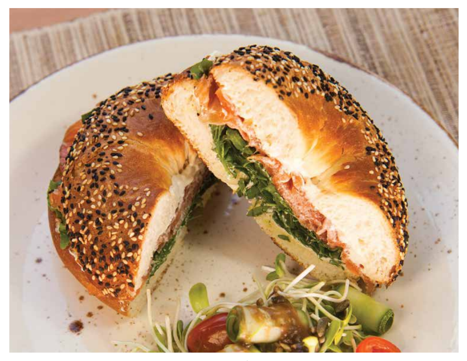
Bagel Le Mexican