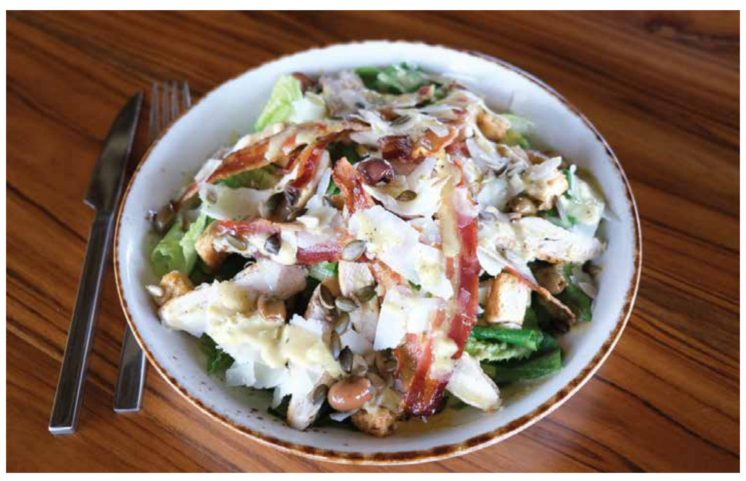
Chicken Cesar Salad