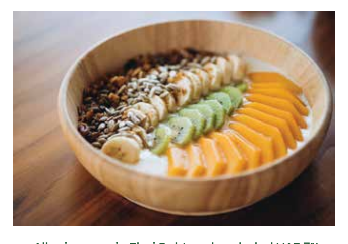
All prices are in Thai Baht and excluded VAT 7%