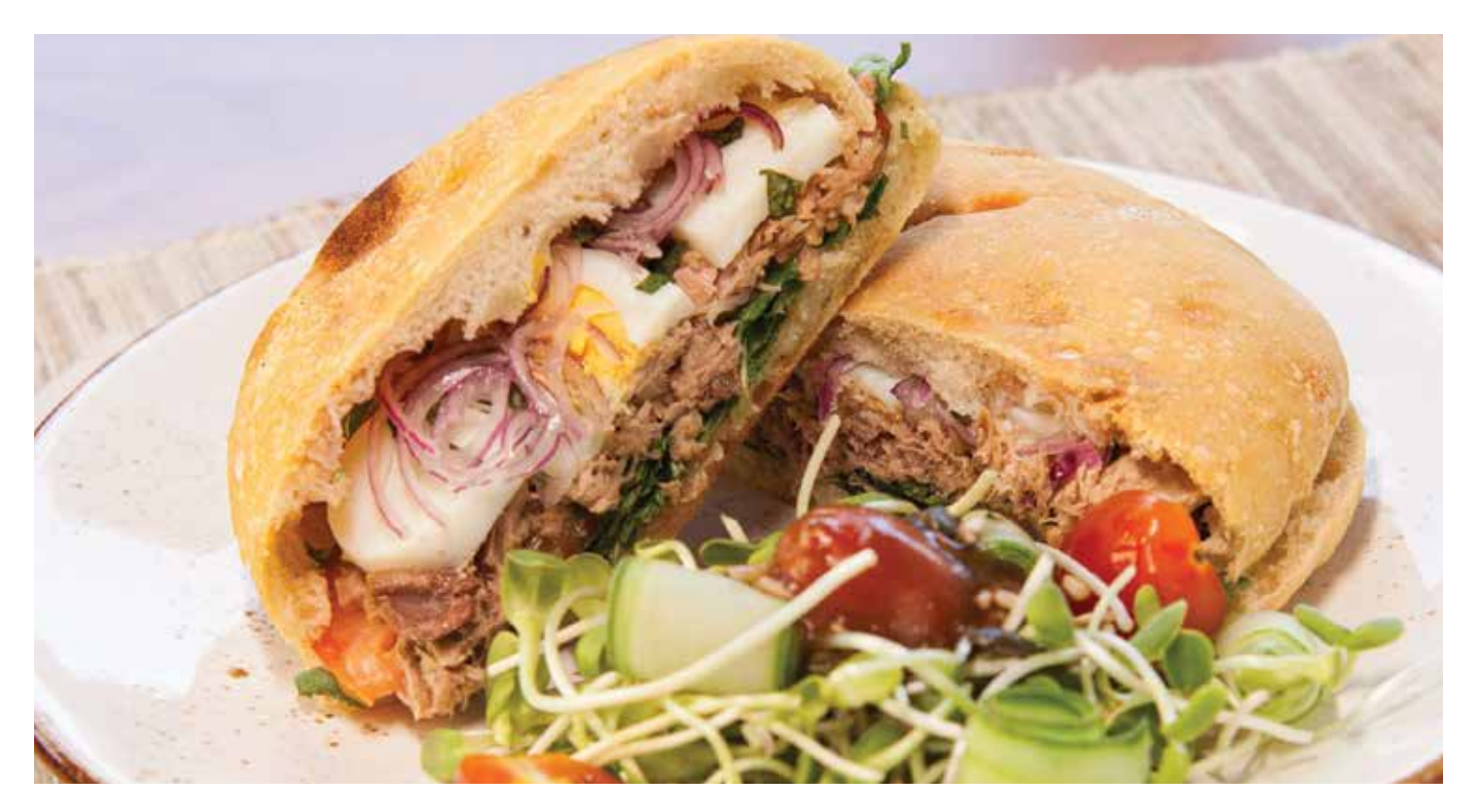
Véritable Pan Bagnat