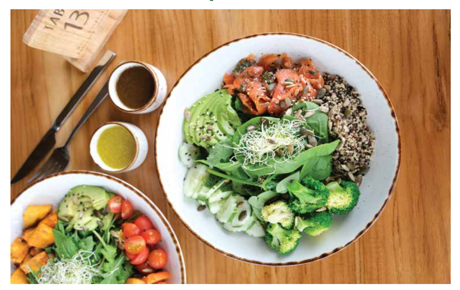
Salmon Buddha Bowl