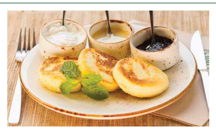
All prices are in Thai Baht and excluded VAT 7%

Russian Cottage Cheese Pancakes served with Sour Cream, Condensed Milk and Organic Jam