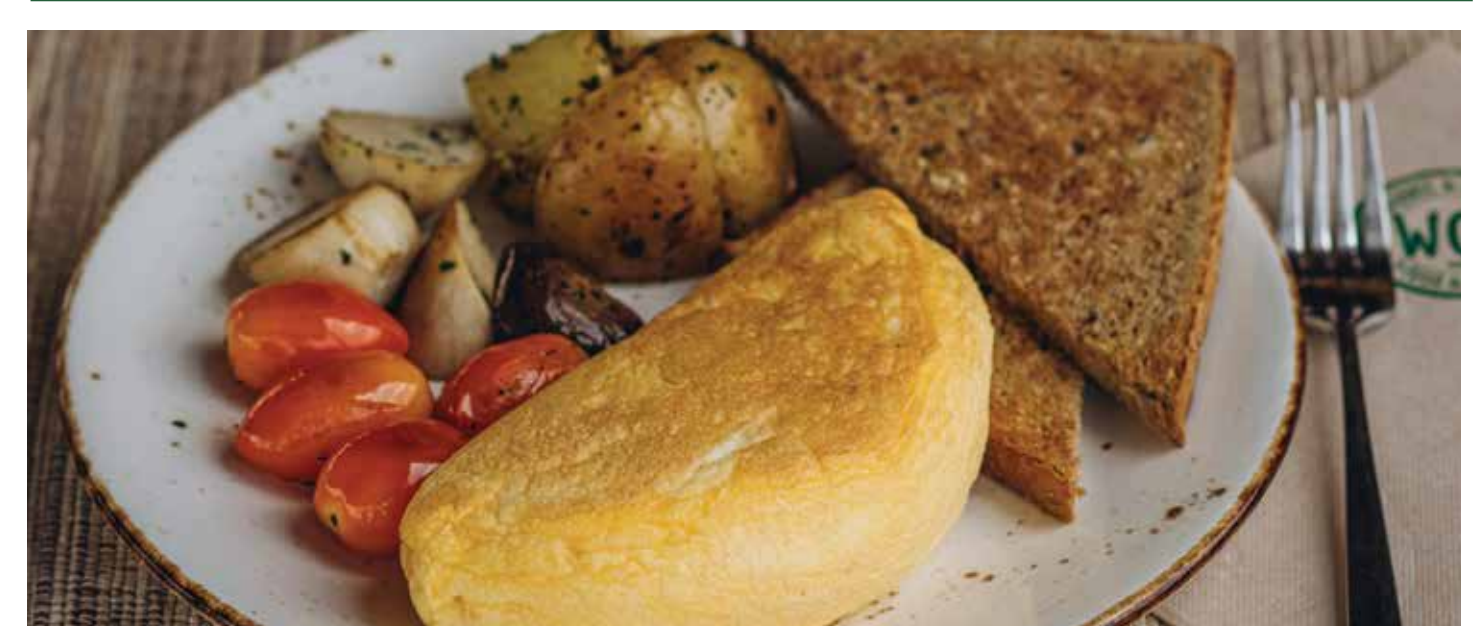
All prices are in Thai Baht and excluded VAT 7%

Woo's Omelette Organic Fluffy Omelette served with Organic Roasted Potatoes, Organic Roasted Tomatoes, Organic Mushrooms and Artisanal Cereals and Seeds Sliced Bread