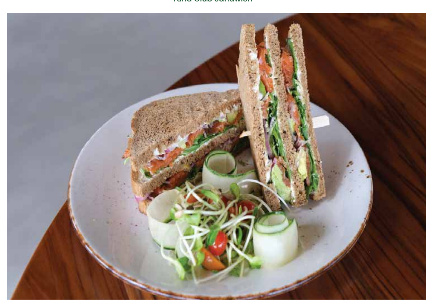
Salmon Club Sandwich

All prices are in Thai Baht and excluded VAT 7%