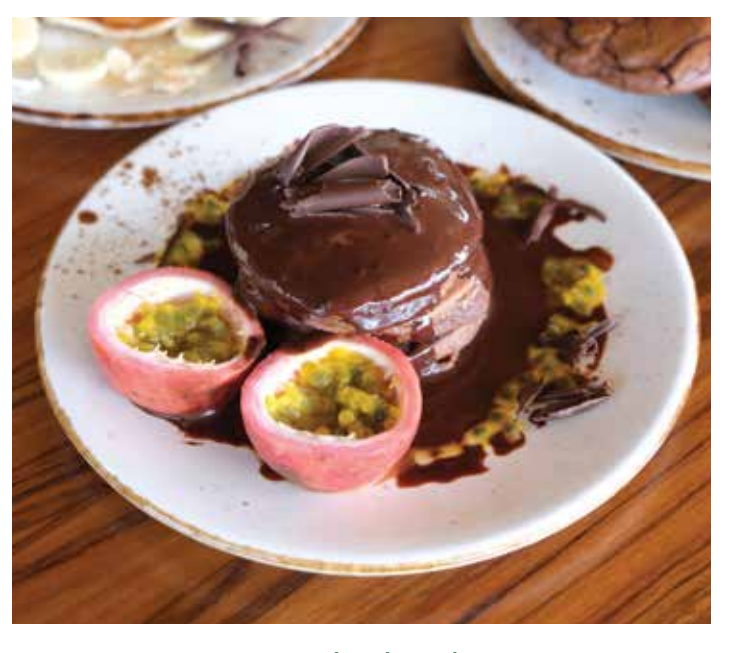
Homemade Chocolate Pancakes

Extra: Organic Homemade Whipped Cream 40